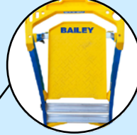
Huge platform area for comfort and stability