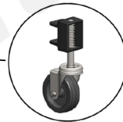
Large 100mm castor repositioned for stability