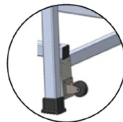
Rear tilt castor included. Choose to fit or not