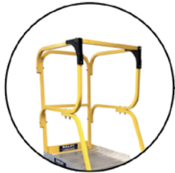
Safety gate included as standard

The new Bailey Order Picking Platforms are packed with features making working at heights safer, easier and more efficient. The Bailey Order Picking Platforms make stock picking a breeze.