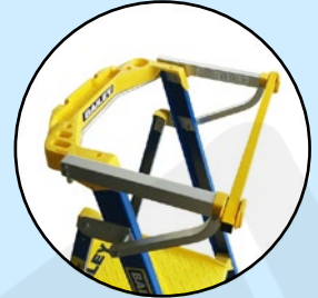
Optional Add On: Platform Stepladder Safety Gate (FS13648)