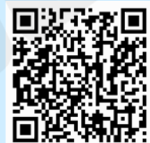
Scan for product information video