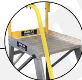
Large platform for extra comfort