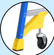
Integrated bracing system