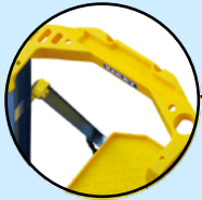
Handrail acts as 15kg capacity Job station

The Bailey P170 range of platform stepladders offers the largest in class platform measuring 610 x 457mm. With a 170kg load rate and industrial duty rating it is extremely durable and job site ready.