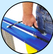
Convenient Carry handle