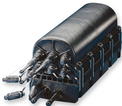
OptiSheath® Sealed Terminal, UCA Series, 6 OptiTap® Connector adapters, 6 pigtails, 2 mechanical ports, wall bracket

For additional part numbers, click on Download Family Specs.